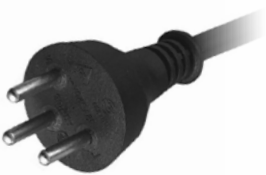
MODE 2 - type H 1EA.971.675.AT (Israel)