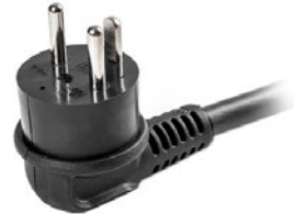
Cable adapter type K for both charging units