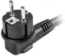
MODE 2 - type E/F 1EA.971.675.AL (EU¹)