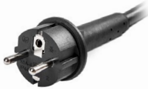
Cable adapter type E/F 8 A 180° for both charging units