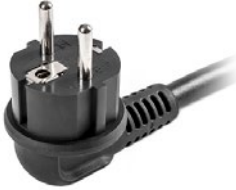
Cable adapter type E/F 10 A 90° for both charging units