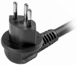
MODE 2 - type J 1EA.971.675.AR (Switzerland)