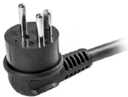
MODE 2 - type K 1EA.971.675.AM (Denmark)