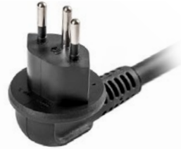
Cable adapter type J for both charging units