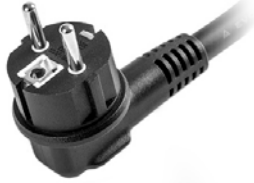
MODE 2 - type F 1EA.971.675.AN (Finland)