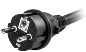
MODE 2 - type E/F 1EA.971.675.AP (Norway, France)