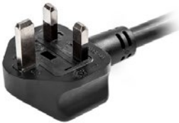
Cable adapter type G for both charging units

7PP971678BL (Cyprus, Great Britain, Ireland, Malta)