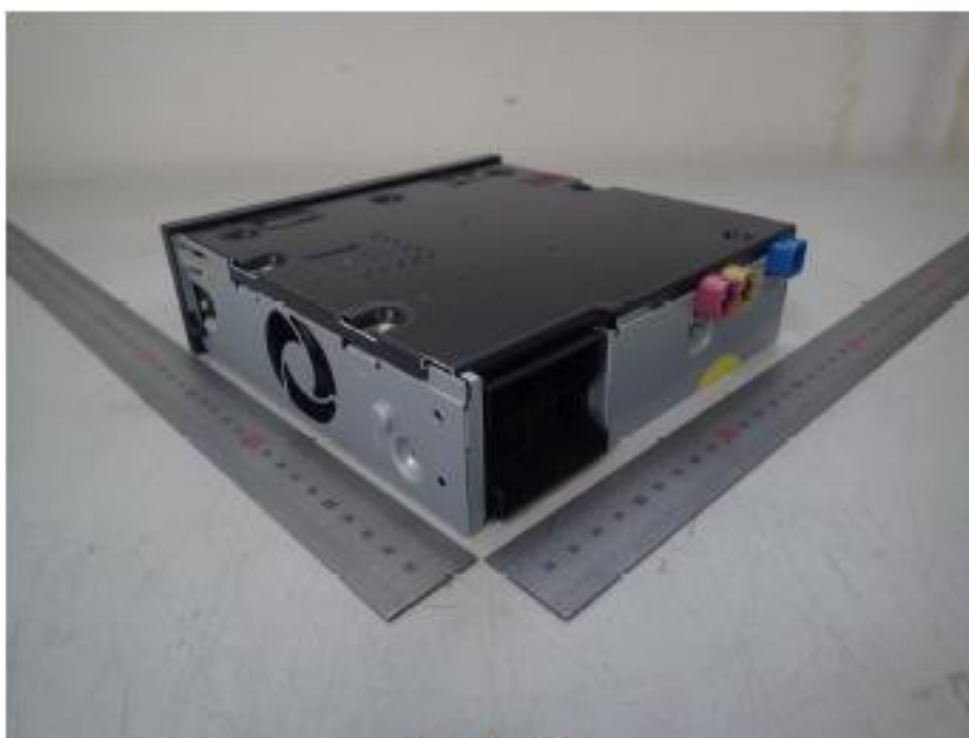
External view II