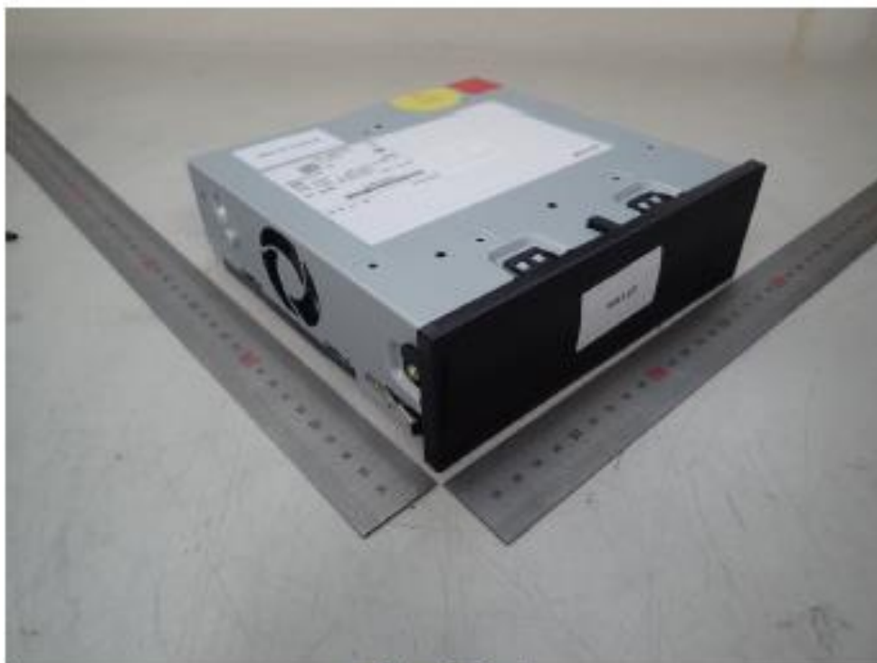
External view I