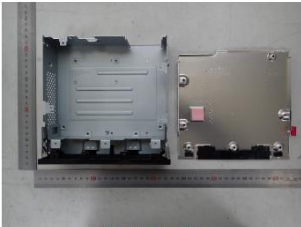
Internal view without PCB