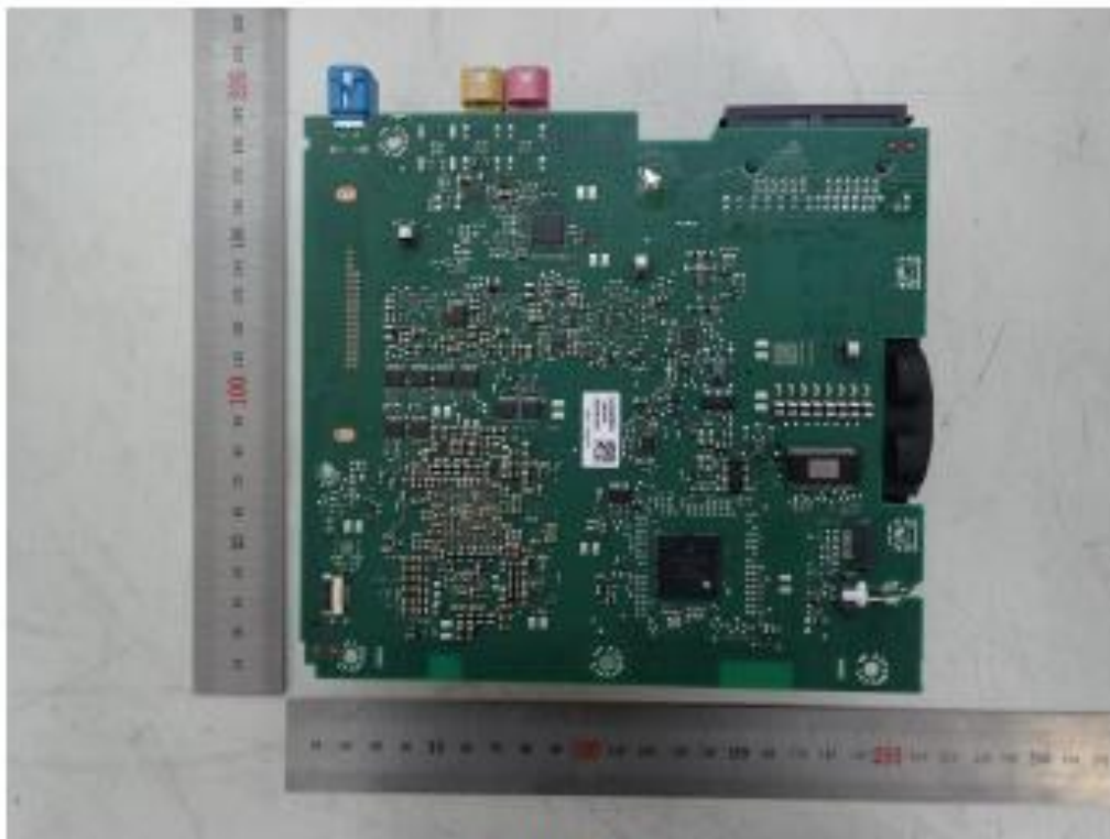
PCB view II