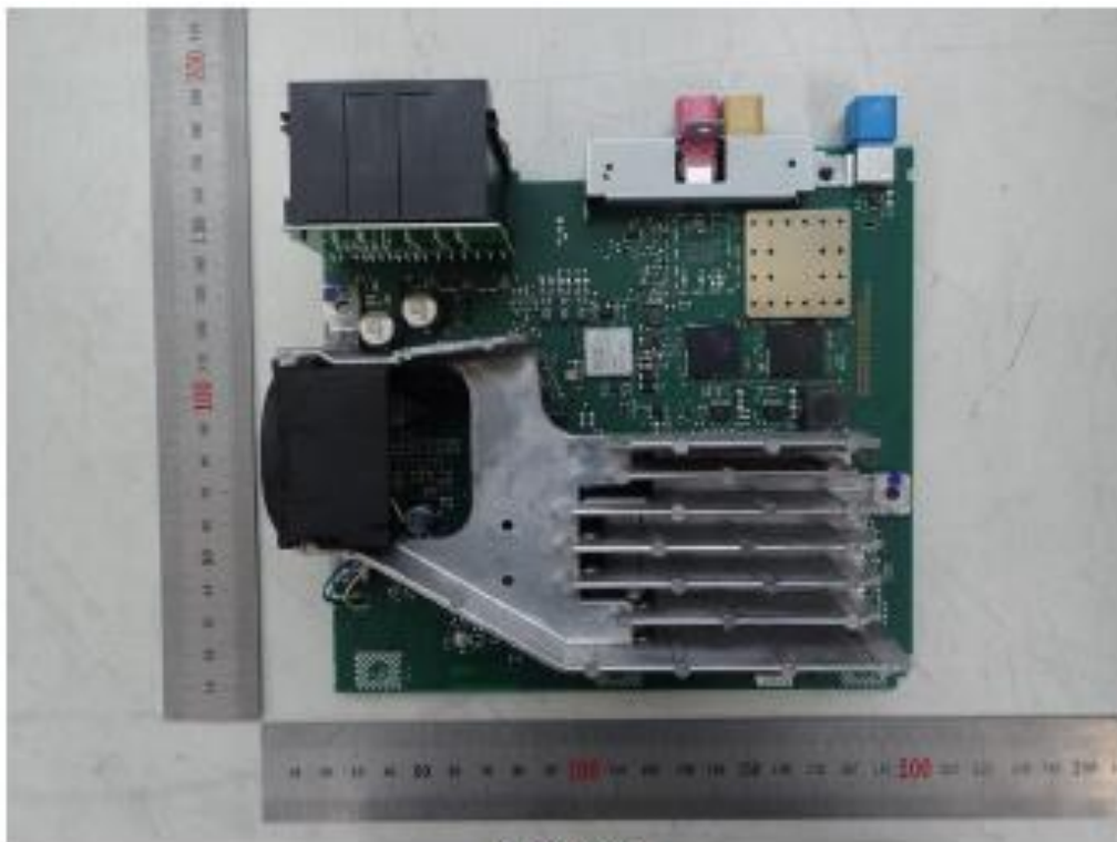
PCB view I