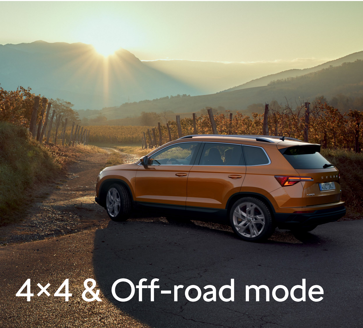
4×4 & Off-road mode